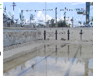
National Stadium Pool

The National Stadium Pool was closed for renovation on May 1, 2009. The proposed date for reopening is January 2010.