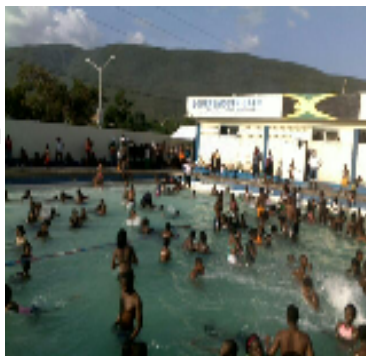
Bournemouth Bath Pool

The Bournemouth Bath pool has been the home for all the Lime sponsored students since May 1, 2009. JUTA has continued to provide the students with transportation.